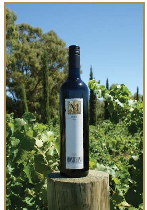
Monichino Durif - Limited Release

This grape is a cross between Peloursin and Syrah developed in the 1880's as a mildew resistant variety by Dr. Durif. A significant proportion of vines grown are called Petite Sirah which are actually Durif. It will do very well in this region as the climate is perfect for growing this grape varietal.