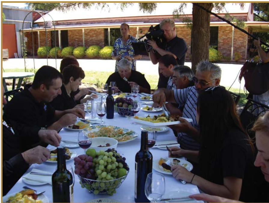
Alfresco Lunch at Monichino Wines

For bookings and enquiries phone 03 5864 6452